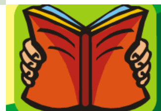
Reading for you